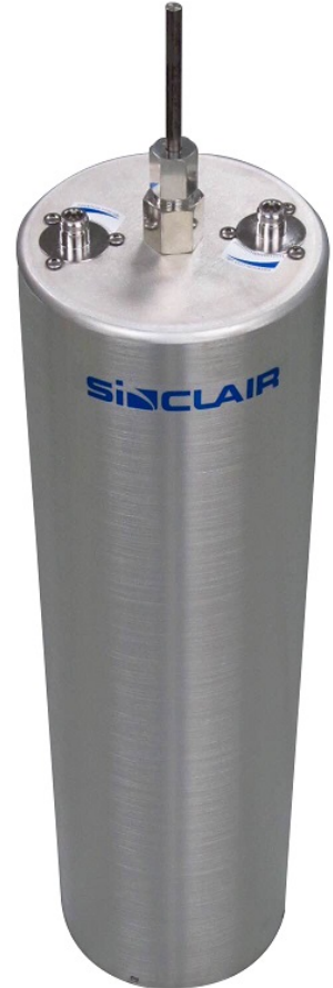
Filter may not appear exactly as picture.