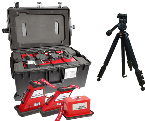
F-16 IFF Coupler Kit, p/n 140600