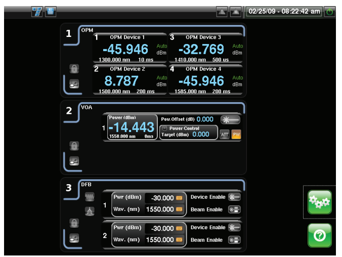
Figure 1. mOPM main user interface